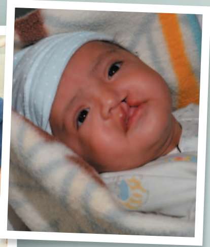
Tijuana